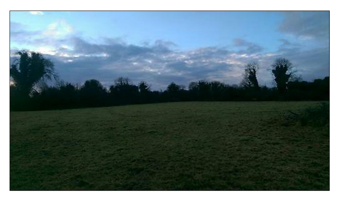
Plate 2: Looking northwest over the proposed development