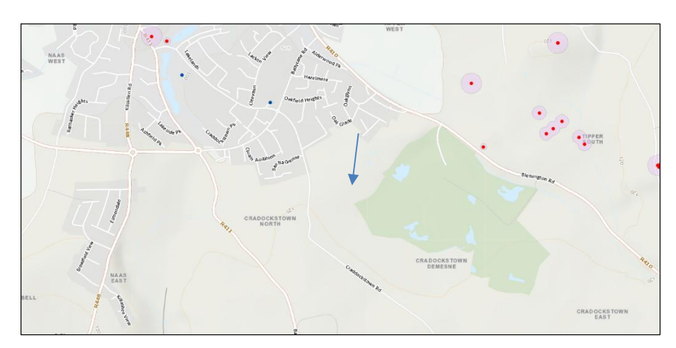
Figure 2: Extract from the RMP for the development with the proposed development marked

The variety of sites show a consistent pattern of settlement from the earliest times. Evidence of additional archaeological remains may be preserved below the ground level. Houses constructed in prehistoric times and up to the 11th century AD were generally made of wood once this decayed the remains can only be detected through archaeological excavation. Similarly, burial sites may not have any surface markers and remain undetected below the surface. Ground disturbance may uncover buried archaeological sites, features or artefacts.