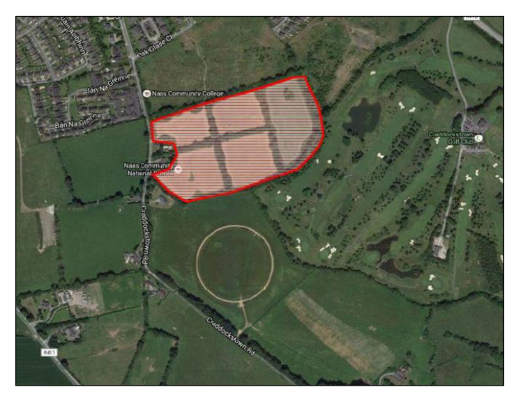
Figure 3: Site boundary