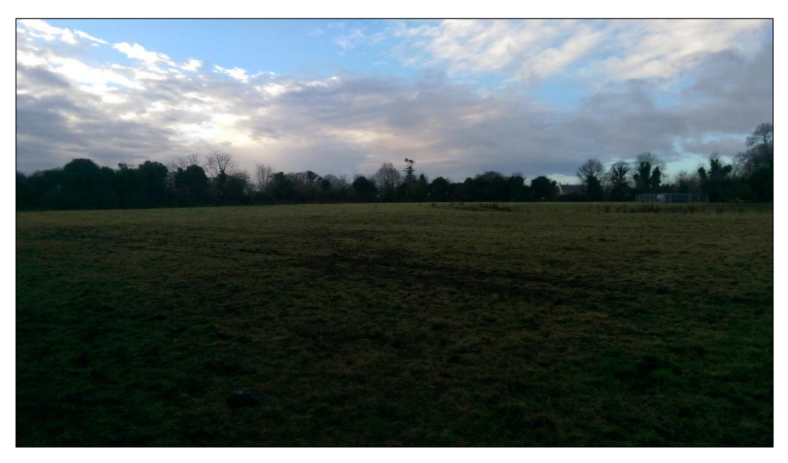
Plate 4: Looking southeast at the south of the proposed development