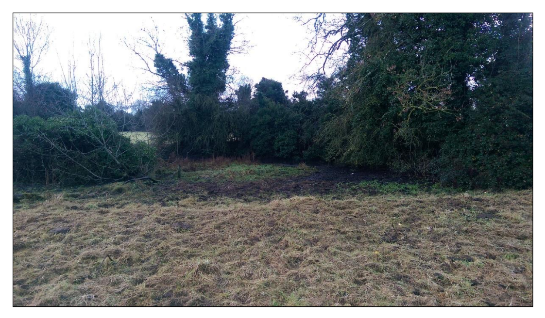
Plate 3: Looking south at the pond at the north of the site