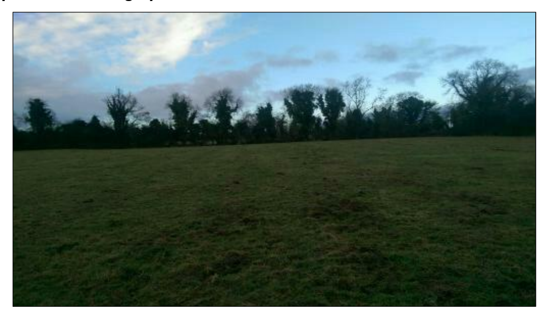
Plate 1: Looking north over the proposed development